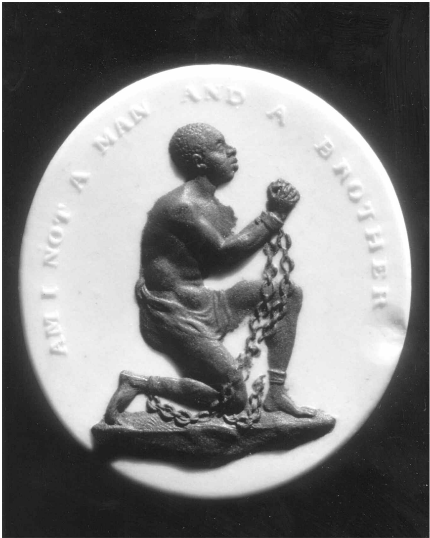
Figure 1, Anti-slavery medallion by Josiah Wedgwood