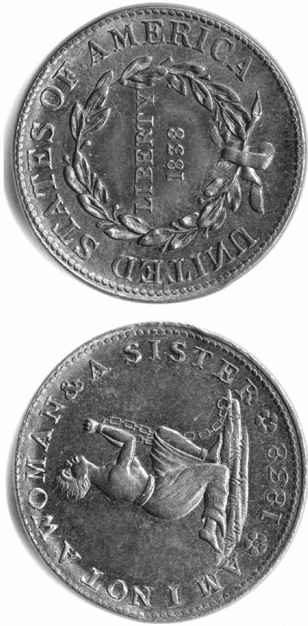
Figure 4: “Am I Not a Woman and a Sister?” Token, courtesy of the Colonial Williamsburg Foundation