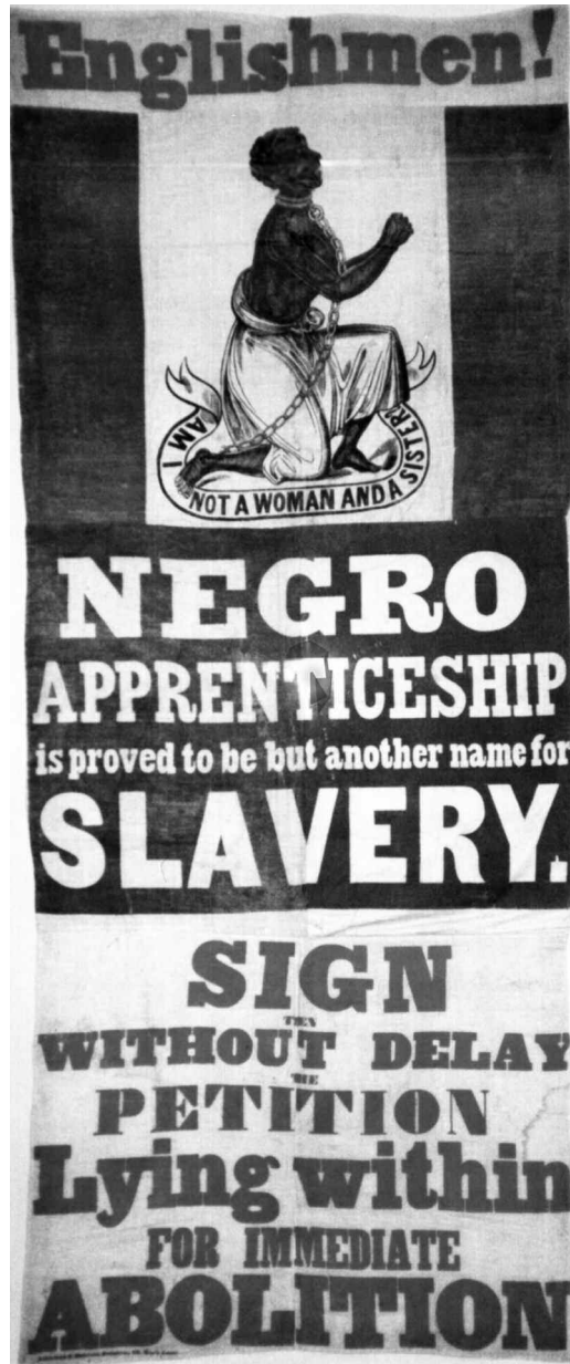
Figure 5: “Am I Not a Woman and a Sister?” image used during campaign against apprenticeship system during 1830’s