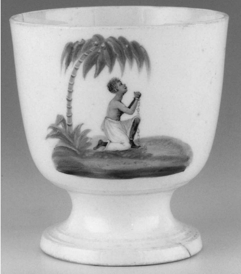
Figure 8: Kneeling slave sugar bowl

India Sugar not made by Slaves. By Six families using East India, instead of West India Sugar, one Slave less is required” (Katz-Hyman). Caribbean sugar was used to sweeten the coffee and tea on which Europeans had become dependent. This is demonstrated in the 1760’s Liverpool coffee pot (Figure 9).