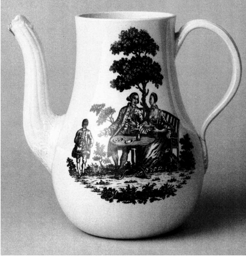
Figure 9: Transfer printed coffee pot, Liverpool 1760–1765

tion of people both in Europe and in the United States to the issue of slavery. As the movement gained momentum, the use of the image became widespread. The image was versatile, and thus able to be used in many different fashions. It was replicated and reused all throughout the abolitionist movement in several different ways, as demonstrated in the examples above and the images provided. One of the qualities of the image that allowed it to be used in such a variety of ways is that the image portrays in a simple fashion much of what poems, pamphlets, articles, and abolitionist phrases were trying to convey.