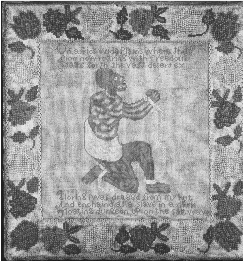
Figure 3: An example of anti-slavery tapestry

order to raise money for the cause. The image, when used in tapestry, would often be paired with a poem, such as William Cowper's "A Negro's Complaint," as seen in Figure 3. Another example of the kneeling slave image is the "Am I Not a Woman and a Sister?" token, which was sold at fundraising-fairs (Figure 4). It may have been one of the greatest sources of revenue for the anti-slavery movement in the U.S. (Katz-Hyman). These tokens depicted the familiar slave cameo image, but replaced the black man with a black woman, kneeling and bound by chains. A similar "Am I Not a Woman and a Sister?" image (Figure 5)