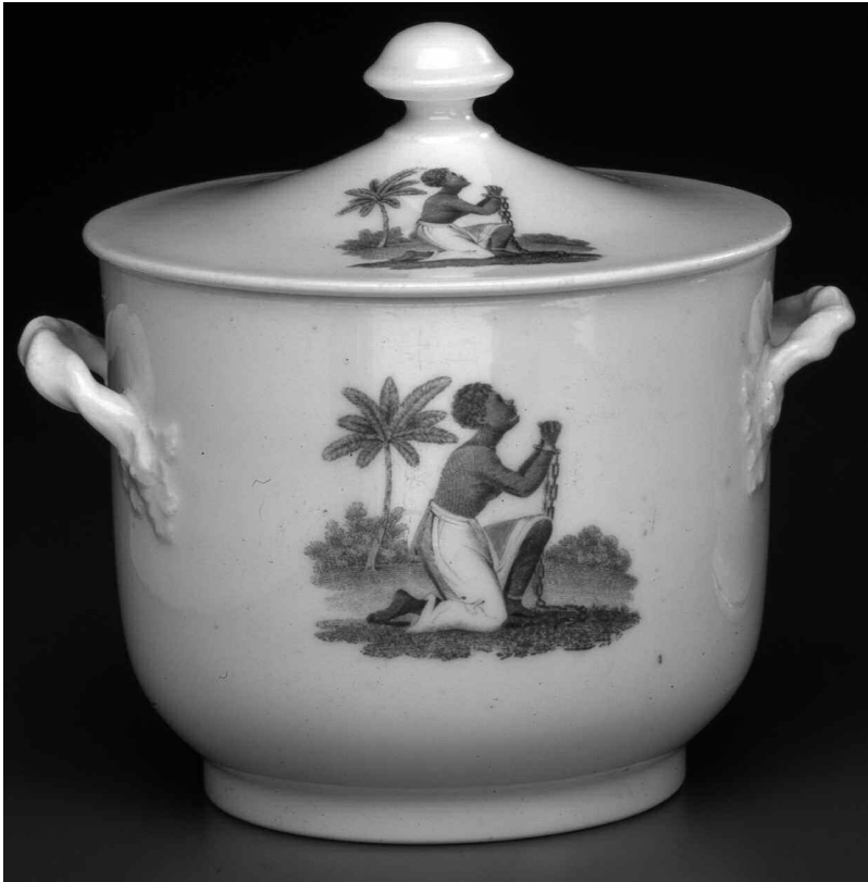
Figure 7: Kneeling slave sugar bowl

were relatively blunt about the message they were conveying. However, several bowls actually used the image of the kneeling slave (such as Figures 7 and 8). These pieces show a West Indian female slave kneeling on the ground underneath a palm tree with a field in the background. Her wrists and ankles are chained. These images, a replica of the Wedgwood cameo, reinforced the reality that women as well as men were enslaved. At times the image was used on its own to convey the message, and at other times it was used in conjunction with the motto of the abstention of West Indian Sugar campaign, such as on the other side of the bowl shown in Figure 9, which reads “East